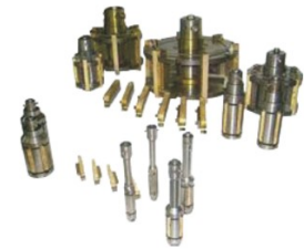
Hydraulic Expansion Honing Tools