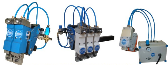
Lathe Mounted Super Finishing Machine