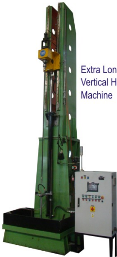
Extra Long Vertical Honing Machine