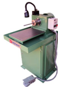
Bench Type Lapping Machine