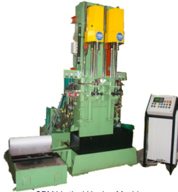
SPM Vertical Honing Machine