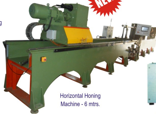
Horizontal Honing Machine - 6 mtrs.