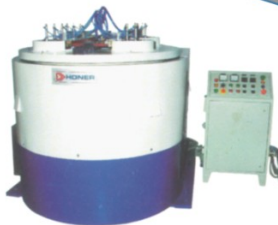
Face Lapping Machine for Connecting Rods