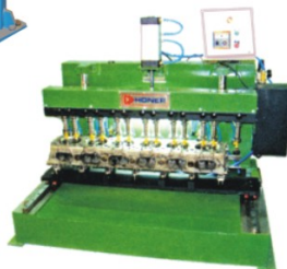
Valve Body Lapping Machine