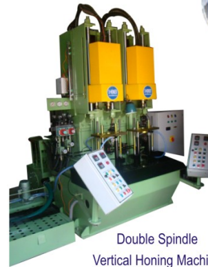
Double Spindle Vertical Honing Machine