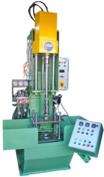
Plato Honing Machine