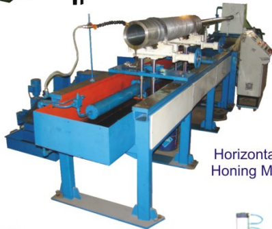
Horizontal Tube Honing Machine